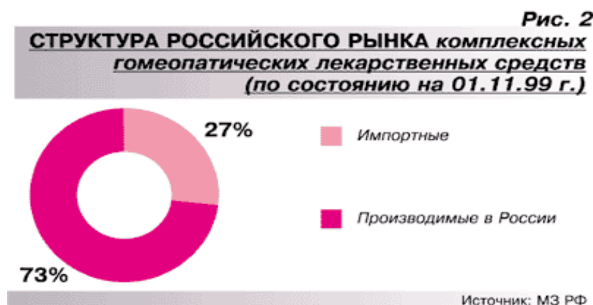
Figure 2. Structure of the Russian market of complex homeopathic pharmaceuticals (as of 01.11.99)

The first registered pharmaceuticals were produced by the International Concern «EDAS» and the NPF «Materia Medika». The Moscow pharmaceutical factory is the oldest manufacturer of such homeopathic medical products as Ledum, Calendula, Arnica, Hypericum, opodeldocs and suppositories. The company «EDAS» manufactures 91 names of complex homeopathic medical products in the form of granules, drops, ointments, opodeldocs, syrups, oils. All homeopathic medical products are included in the federal license for manufacture, and pass state control.