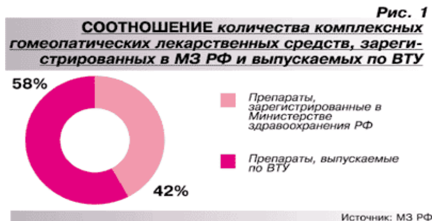
Figure 1. Ratio of quantity of complex homeopathic medicines registered in the Ministry of Health of the Russian Federation and manufactured under TS